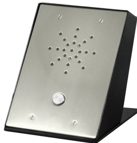
Back box featured with installed Bogen model VRS1 Speaker.

For over 30 years Chase Security products have been manufactured in a variety of sizes, styles and finishes, and sold to OEM accounts and distribution and installed by Government Institutions, Prisons, HUD, Projects, Universities, Hotels, Parks, Schools, Hospitals, and other public locations where both functionality and aesthetics count.