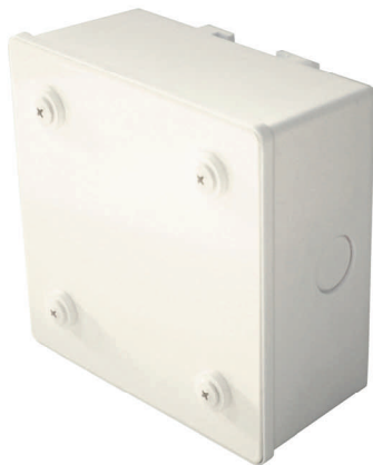
Cover plate featured with Cooper Wheelock IOB Series Back box (Not included)