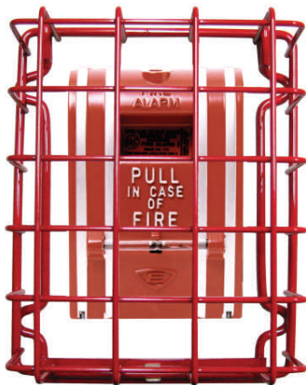
Guard pictured with Edwards Systems Technology SIGA-270 Fire Alarm