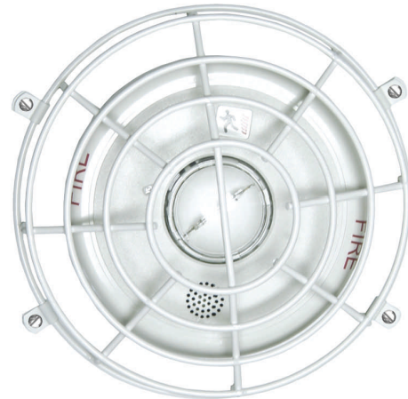
Guard pictured with Genesis GC-HDVMH Ceiling Horn-Strobe

Can be used in a variety of applications.