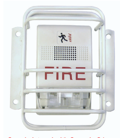
Wire Guard pictured with Genesis G1 Series Chime Strobe

Can be used in a variety of applications.