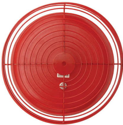
Guard pictured with Wheelock MB-G10-24 Vibrating Bell