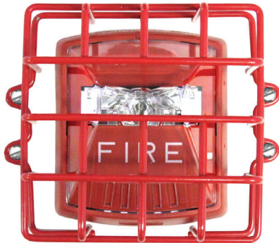
Guard pictured with Wheelock Exceder STR Strobe Device

Can be used in a variety of applications.