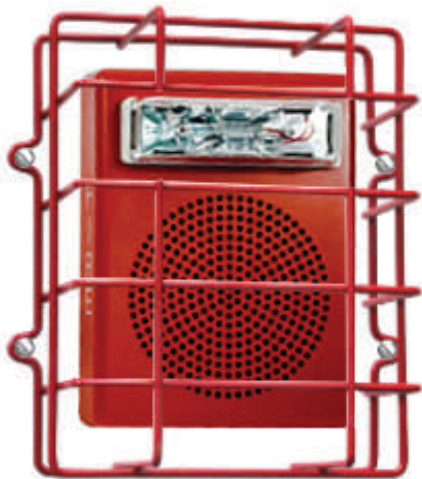
Guard pictured with Wheelock E50-24MCW Speaker Strobe