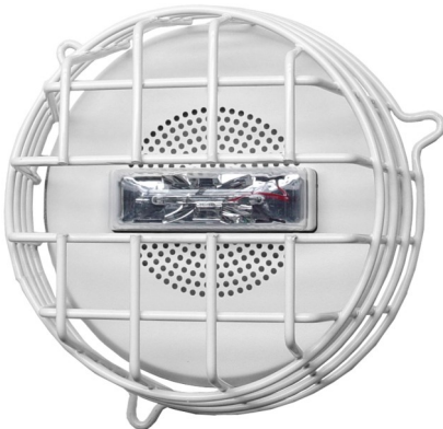
Guard pictured with Wheelock CH-90 Chime Strobe